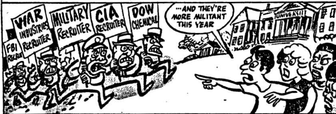
Daily World (Communist) 6 SEP 1969

J. EDGAR HOOVER PREDICTED U.S. CAMPUSES WILL HAVE A "CONTINUATION OF THE SENSELESS PLUNDER" BY "FIREBRANDS"